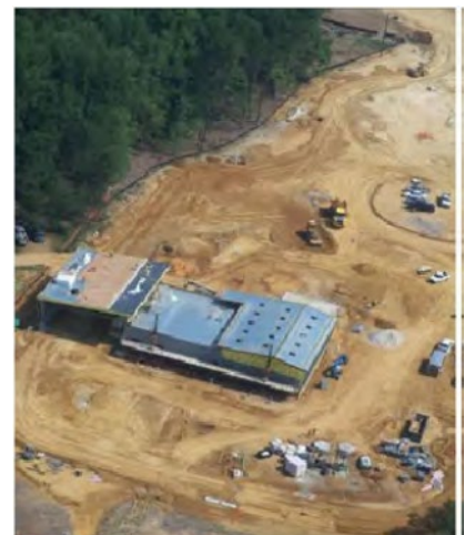
IDIQ-Remote Inspection Facility